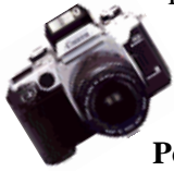
Photo Magic, Offers several portfolio options to ensure that each client is getting exactly what they need. To make the process easier for you, the customer, we have developed a standard package and for more advanced portfolios, you may select from our list of optional services. All fees are due prior to work being performed if you don't choose a package when make appointment you can just pay $75.00 Setting (3hr studio time) make selection later.